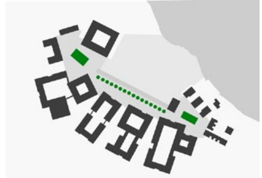
Promenade connecting the squares