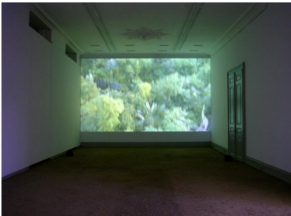
room 2 – nature

The design of nature calls for in-depth knowledge and stands at the beginning of every design process.