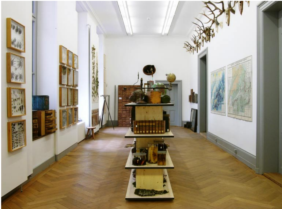
room 1 – museum

The design of nature calls for in-depth knowledge and stands at the beginning of every design process.