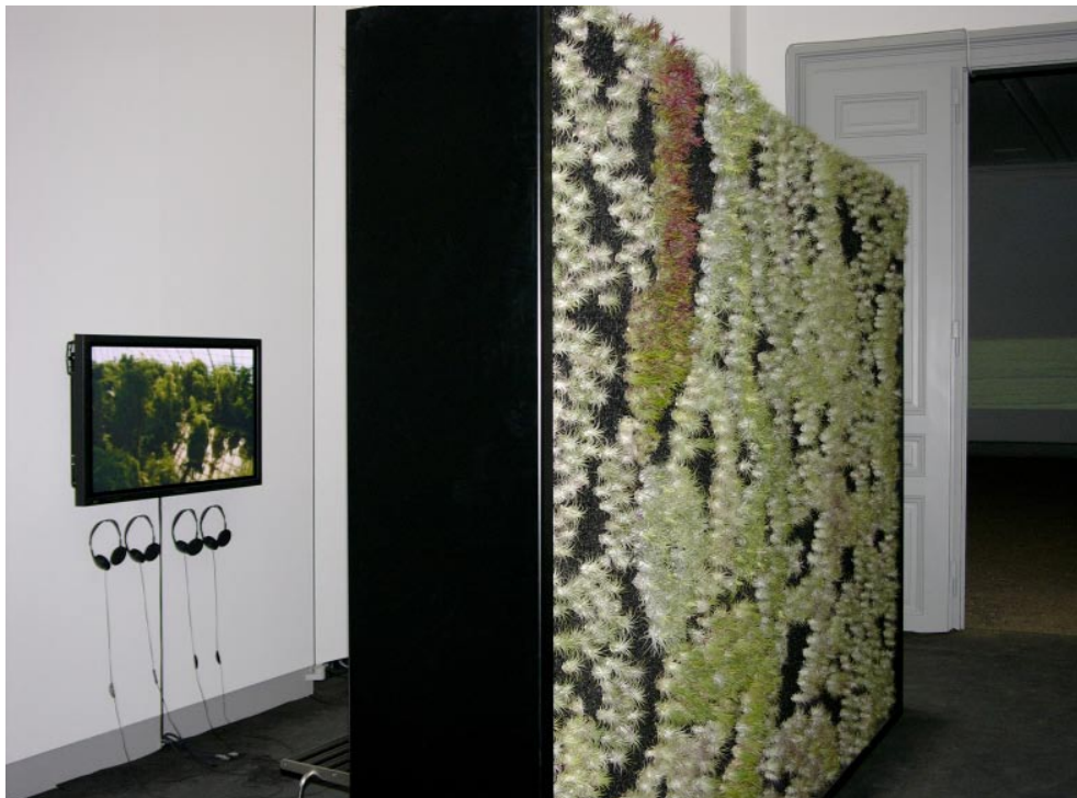
room 3 – city

The medium of the film presents completed projects integrated in their urban context.